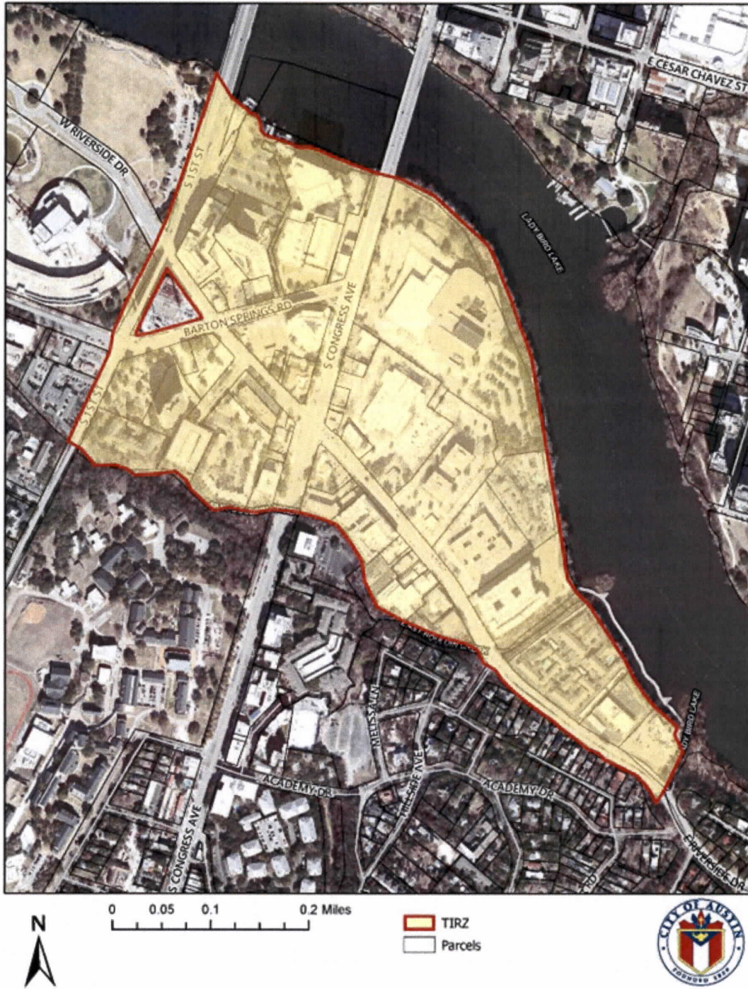
Exhibit A: Boundary Map